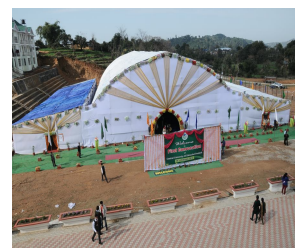
Convocation Pandaal in The making

Hon'ble Vice-Chancellor formally recognized and appreciated efforts of every teaching and non-teaching members of CUHP fraternity in a graceful function on March 22, 2013. He exhorted everyone to put in their best to make the second convocation even better than the first one.