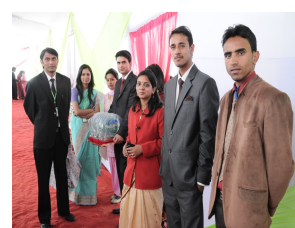
Waiting for the Convocation to begin